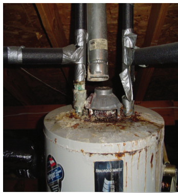
Plumbing Problems – Water Heater