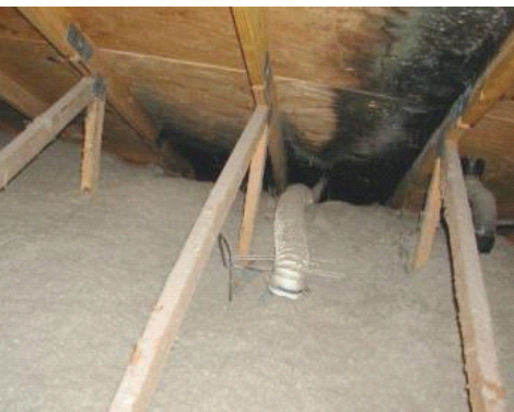
Crawlspace / Attic Ventilation

In a related area of litigation, Van Duyne has handled numerous real estate cases stemming from sales that went “bad” either due to failure to properly and legally disclose defects in a home during an escrow via the “SRPD” or due to a deliberate attempt to cover up defects existing at a home. Oftentimes an Association’s governing documents play an important part in these types of cases.